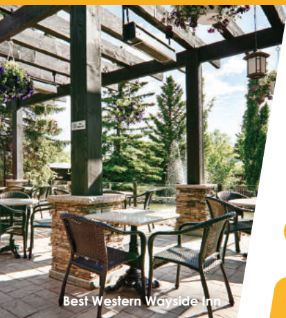
Best Western Wayside Inn