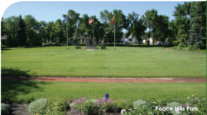
Peace Hills Park

Situated in our downtown, Diamond Jubilee Park is home to the cenotaph, a memorial to 'Fallen Comrades' in the Canadian Forces. As one of the oldest parks in Wetaskiwin, you will find some magnificent trees as well as a Heritage Perennial Garden showcasing beautiful perennial plants from members of the community.